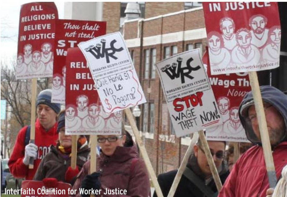
Interfaith Coalition for Worker Justice